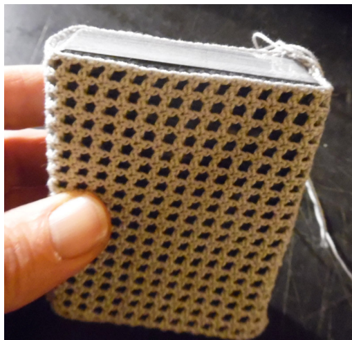
Round 20 (15) Complete

Mini Rounds 3 through 15: Ch 4, sk next ch-1 space, [dc in next dc, ch 1, sk next ch-1 sp] around, join with sl st in 3rd ch of beginning ch-4.